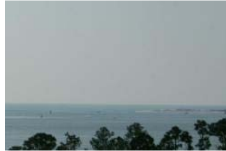
Site of Fort McRee

The sand point visible in the distance in the right of this photograph was the site of Fort McRee, the lost fort of Pensacola Bay.