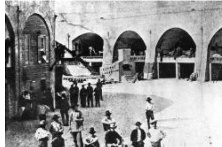
Fort McRee in 1861

The sand point visible in the distance in the right of this photograph was the site of Fort McRee, the lost fort of Pensacola Bay.